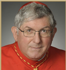
CARDINAL THOMAS COLLINS Archbishop of Toronto