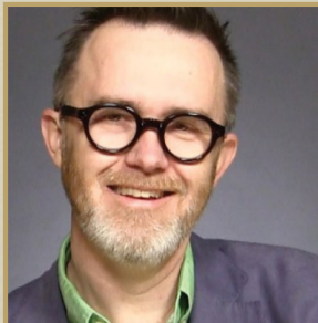
ROD DREHER Author of the New York Times bestseller, The Benedict Option

Whither goeth the family? That fundamental institution that has survived kingdoms and epochs seems to be under attack from all sides. Is it warproof? Is it weatherproof? Or is it doomed?