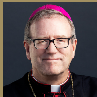
BISHOP ROBERT BARRON BISHOP OF WINONA-ROCHESTER & FOUNDER OF WORD ON FIRE

"Religion is not a thing like a theory but a thing like a love-affair."